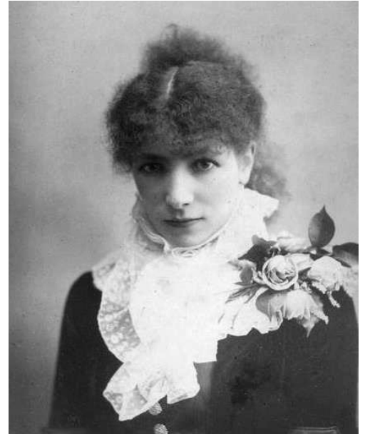
Sarah Bernhardt (portrait 1890s)