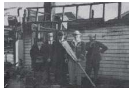
Club officers pose for a photograph in the aftermath of the fire in August 1934..

Further additions were made until another disastrous fire on 25th August 1934 destroyed the main portion of the old inn, leaving only the domestic quarters standing. In 1946, the club decided to discontinue all its activities at Woolloomooloo Bay because of the increase in commercial traffic on the harbour. The focus of attention therefore switched to Abbotsford and it was decided that the future development of the club would be centred there.