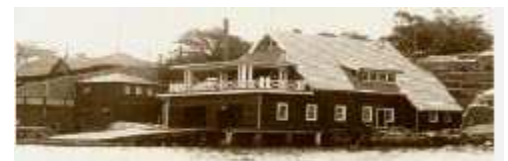
The Sydney Rowing Club's new boatshed at Woolloomooloo Bay shortly after it was erected at the end of 1922.