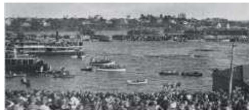
The 1928 GPS regatta on the Parramatta River with the Head of the River won by Shore.